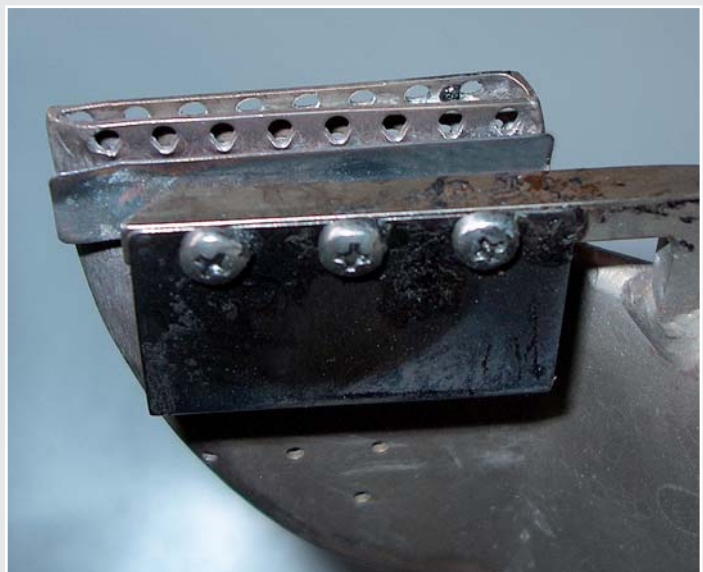
Upper part of grip-nozzle with (sheet pressure plate) downholder – the burls (grips) are hidden underneath.