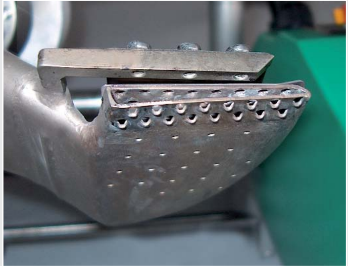
Lower part of grip-nozzle with burls or grips.

Although a 40 mm standard nozzle is widely accepted, problems can sometimes appear when using TPO material. An example would be if the material lies on the roof overnight; the TPO shows aging effects and the material can absorb moisture.