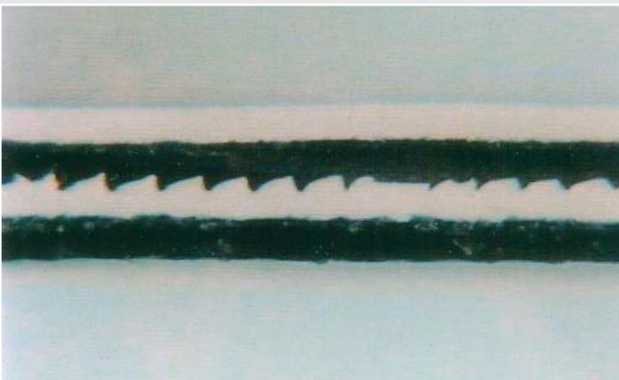
Below: cross-section of a TPO-sheet with grip-nozzle (sevenfold enlargement).