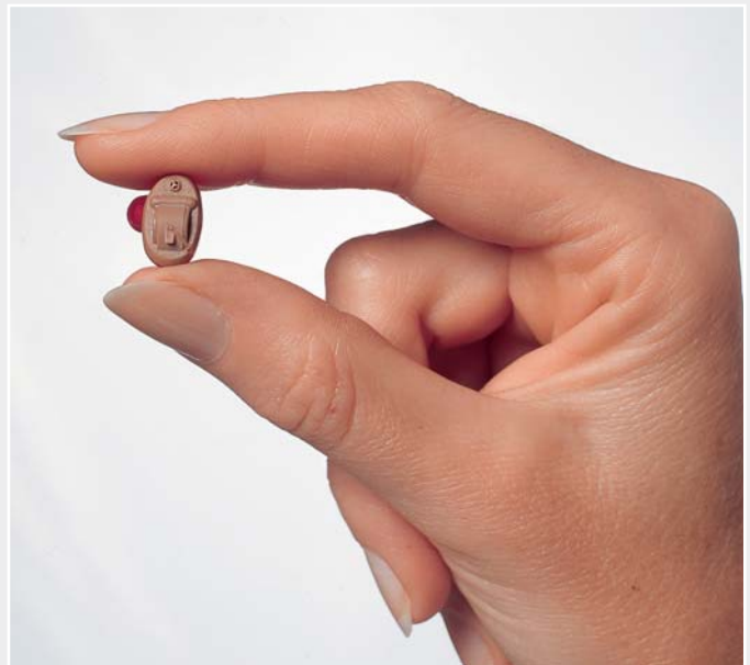
A typical ITE hearing aid is nowadays only as big as the tip of your little finger.

Hardness of hearing and reduced hearing capability is widespread. In many cases these conditions can be relieved to a large degree by the use of modern hearing aids.