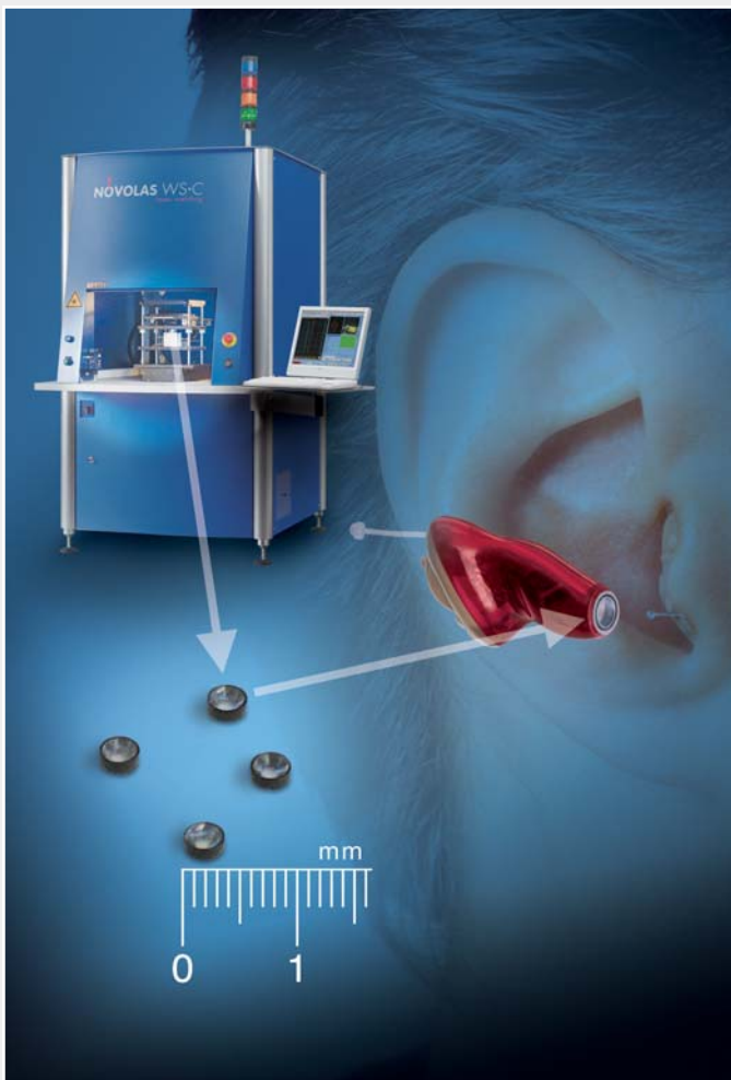
The diaphragm is welded upon the cerumen protection on a Leister WS (work station).

The Swiss hearing aid specialist Phonak has a turnover of more than a billion Swiss Francs and a global market share of 16 to 17 % and is thus one of the leading hearing aid manufacturers in the world. Phonak is constantly making new innovations that make a considerable contribution to