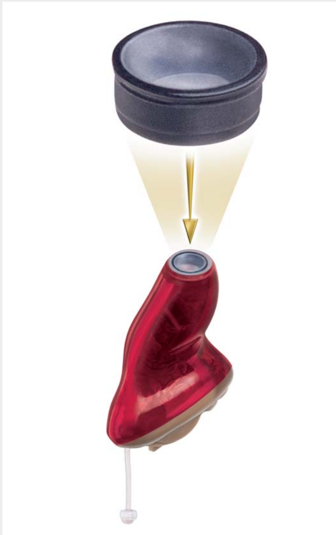
The «SmartGuard» protection system with the 15 µm thick diaphragm is bonded to the carrier ring using laser welding.

the improvement in quality of life of people with hearing damage. One of these innovations is the new cerumen protector «SmartGuard». This uses a 15 µm thick polymer diaphragm to protect the sound outlet from cerumen and moisture, without having any significant deleterious effect on the acoustic properties. The diaphragm is mounted on a thermoplastic carrier ring. The strength of the connection to the carrier ring is high, despite the small area of the joint. Any deposits on the diaphragm can be removed by regular wiping with a soft cloth. This does not damage the diaphragm or the connection to the carrier ring, thus ensuring a long working life for the cerumen protector.