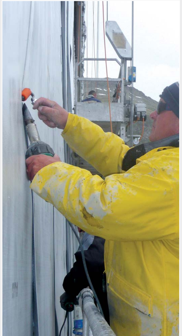
All the plastic sealing strips were overlap welded using the reliable TRIAC S hand tool.

Two operators welded the individual strips in parallel. They stood on suspended platforms lowered down from the top of the wall. Using this strategy, four teams processed approximately 18,000 metres of welds within a few weeks. Up to ten TRIAC S units were in use at any one time. None of the hand welders failed during the course of the project. The TRIAC S is the hand welder of choice for professional users and has been deployed hundreds of thousands of times around the world in countless applications. In addition to its high level of reliability, the professionals are particularly impressed by its ease of use and the wide range of accessories that are available. Alongside the TRIAC S Leister offers the TRIAC PID, a hand welder which features a digital display PID electronic control system. This ensures that the temperature is precisely regulated in a stepless manner, independent of the line voltage or ambient temperature.