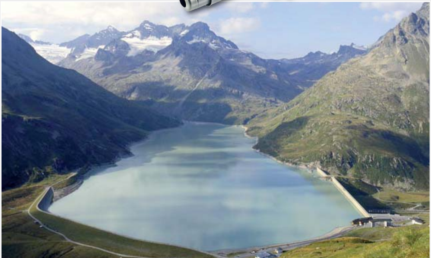
Bird's eye view of lake Silvretta. Bottom right – the 80 m high main wall, above it the 31 m high ancillary wall.

Project planning and management: CARPI TECH S.A., 6830 Chiasso, Switzerland, www.carpitech.com