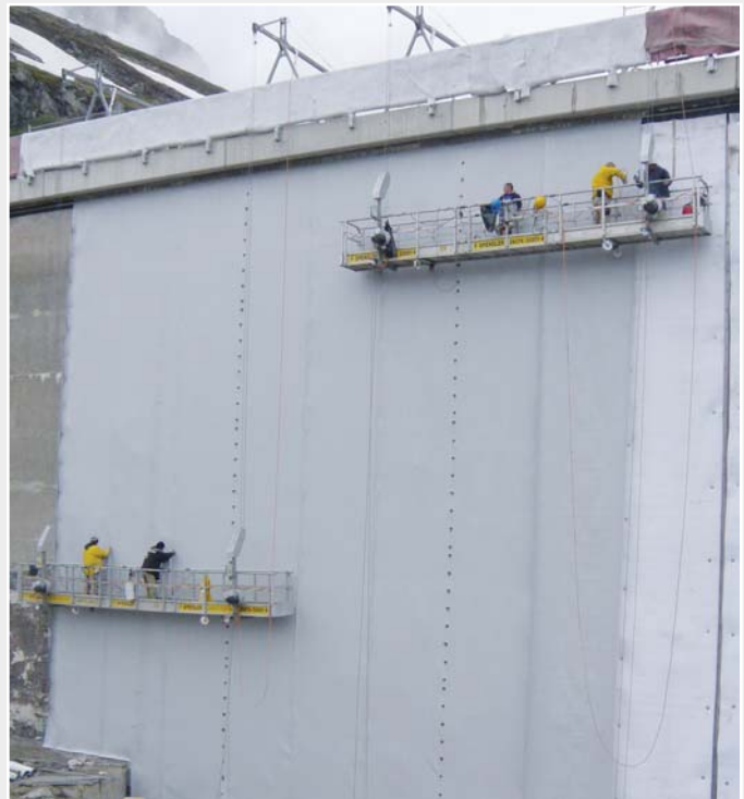
Working on the side wall. The individual strips are welded in parallel.

The main wall is 80 metres high. The width at the top of the wall is 432 metres. The smaller side wall is 32 metres high and 140 metres wide. The lake extends over an area of 1.31 km 2 and contains almost 38.6 million m 3 of water. Both retaining walls will be equipped with a new sealing system to provide protection for the concrete walls which were built in 1938. The smaller side walls and two thirds of the main wall have already been sealed. The sealing system for the main wall is being completed in two stages. The lower third will be finished next spring after the Silvretta lake has been drained.