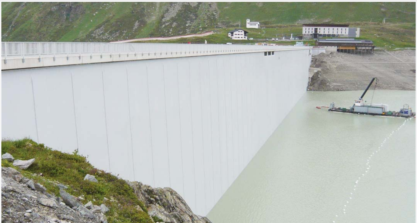
The sealed main wall. The work on the lower third will be completed next spring when the lake has been drained.