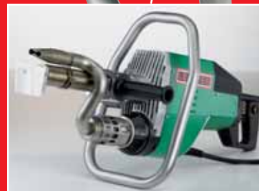
«Steering wheel» handle designed by welders