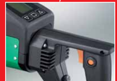
Ergonomic handle allows to weld in upright position