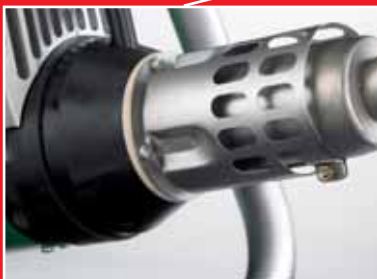
Maintenance free blower