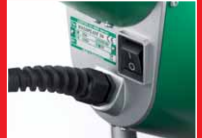
Completely integrated in «bullet proof» housing