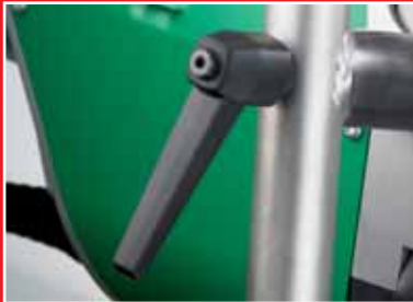
Symmetrical handle fixation mountable left and right